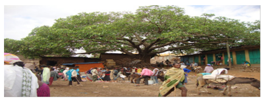
Figure 3: A model to show the function of the market

Here, it is easy to extrapolate that market transactions, occupation, and production of some items were reflected through religion and culture. For example, Muslims were socially recognized for their weaving. On the other hand, pottery and metal works were left for the Felashas while retailing was for Muslims.