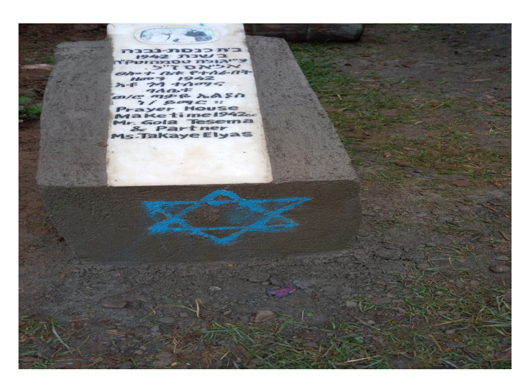
Figure 4: Falasha Residence Area at Gondar (Own Model, 2018)

Tolossa (2010) discussed that the migration of Jews to Ethiopia took place when Ethiopis, the grandson of Jherto came carrying the replica of the Ark of the Covenant while the second migration of the Israel's 12 tribes ensued Minlik to Ethiopia with real Ark of the Covenant. Thus, Tolossa argued that Jews and Ethiopians share the same cultural history to the extent of worshiping the same God. At the end of Gondarian period, the Falashas have lost their relevance due to the disjuncture of the building activities. Nevertheless, their importance in crafting pottery and smiting remained vital even after the decline of the Gondarian period.