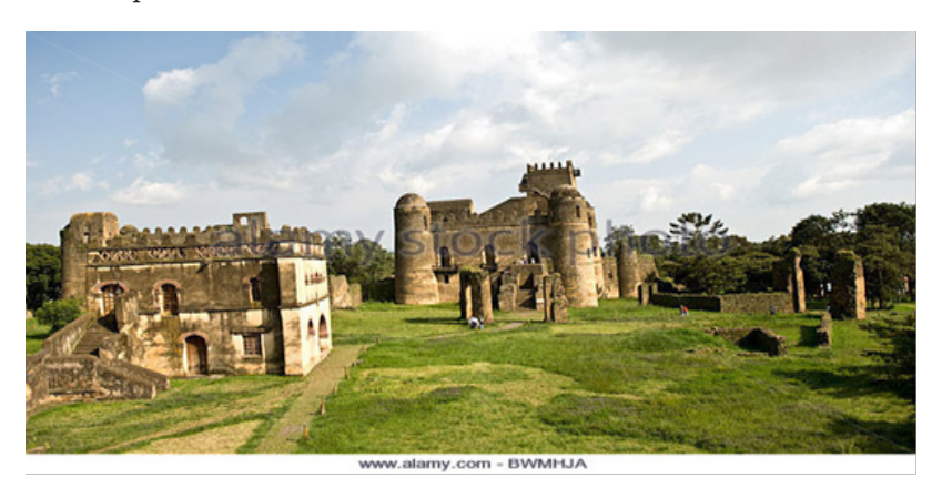
Figure 1: The Gondarine castles at Fasil Gibbe

Among many of the igniters of Gondarian urbanization, one finds castle as castles were the magnets of urbanization (Biru, 2016) and thus the city of Gondar is the by-product of castles and churches. The construction of the castle or Bête Mengist [house of governance] was the principal trigerer for the emergence of Gondar. The castles were built in an area between Angereb and Qeha rivers - surrounded by several churches and residences of the echege [The head monk of EOC] (Kasssa, 2010). The royal enclosure was residential for the royal families and their servants. E. Isaac (2012) commented that castles served the Ethiopian empire to organize monarchical institutions through which the kings discharged their responsibilities.