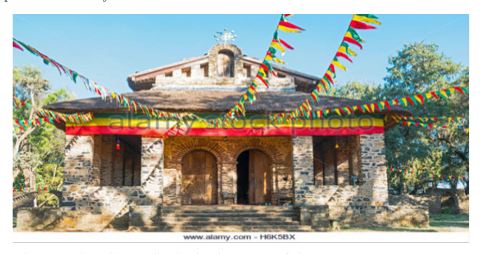
Figure 2: Debre Brihane Sellassie Church

Durkheim (1912/1995) defined religion as a system of practical belief that unites people who adhere to it through (Weber (1920/1963: 29). The Gondarian royal enclosure was a center for the churches that was built to unite and congregate people. With the expansion of the city boundary, the churches were also built in relatively far places to the city center near the palace. Among the forty four churches, some were engulfed by the physical expansion of the city.