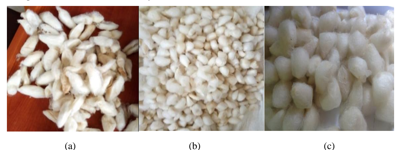
Figure 5. (a) Coon produced by Rural enterprise (b) by smallholder women (c) by Bere sericulture PLC

Cocoon to yarn processors and their role along the sericulture value chain