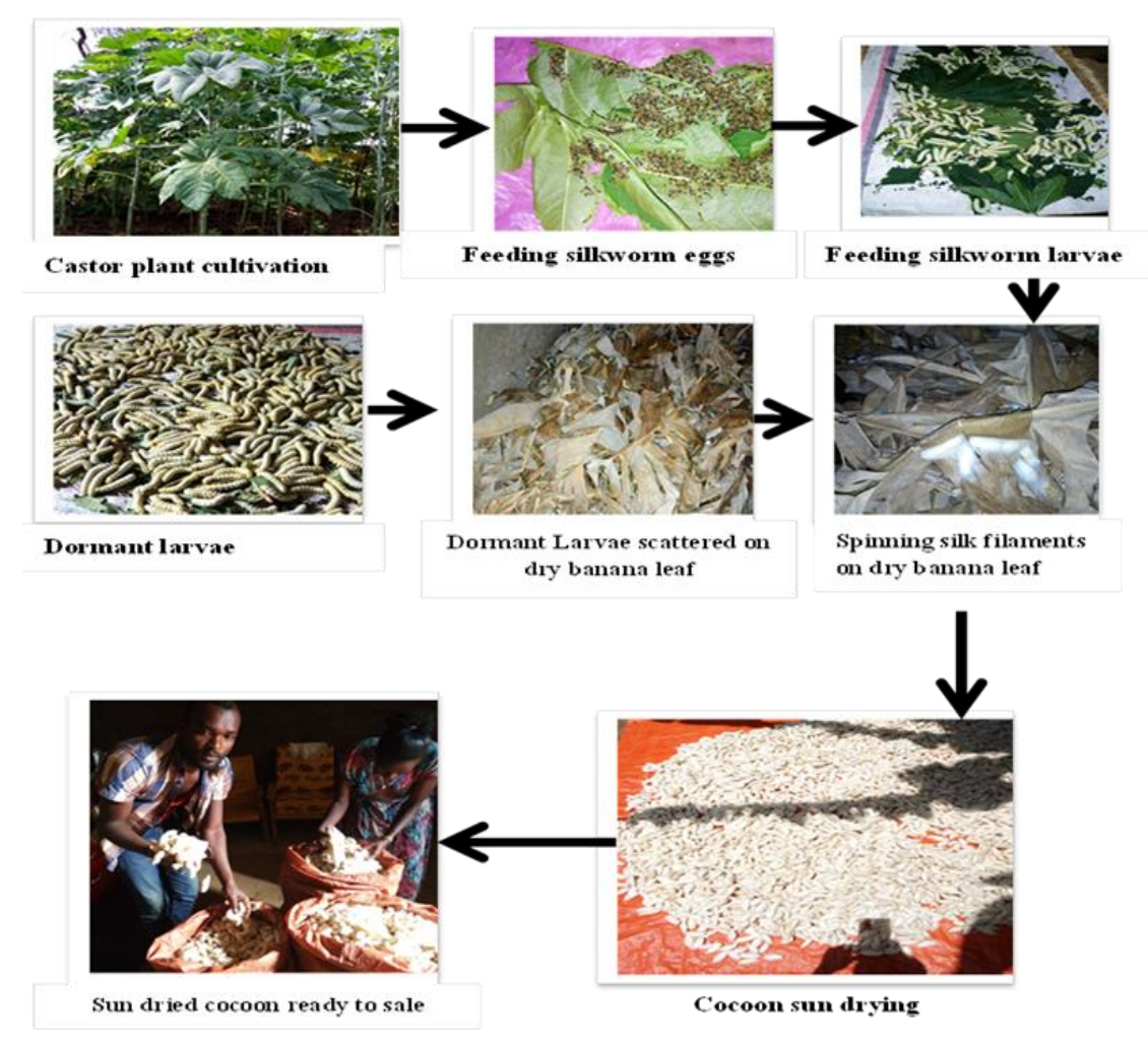
Figure 2. Rural enterprise and smallholder women sericulture value adding activities

all silkworm rearing houses were florid with mud and did not allow airation, but silkworm feeding trays were arranged with appropraite spacing. All smallholder women did not have separated rearing house and they use their dining room and salon for silkworm rearing and feeding tray arrangement was not well spaced and some women used the chair and table as feeding tray bed. Both smallholder women and rural enterprises used dry banana leaf as cooconing tray.Both rural youth sericulture producer enterprises and smallholder women bring silkworm eggs from Bere Sericulture PLC and then, they started feeding castor plant leaf. When larvae reached dormant stage they scattered larvae on dry banana leaf to spin silk filaments. When larvae completed silk filament spinning it became cocoon and then, they harvested it at 10<sup>th</sup> day of spinning and dried the cocoon with sun after well pupation physiological growth performed.