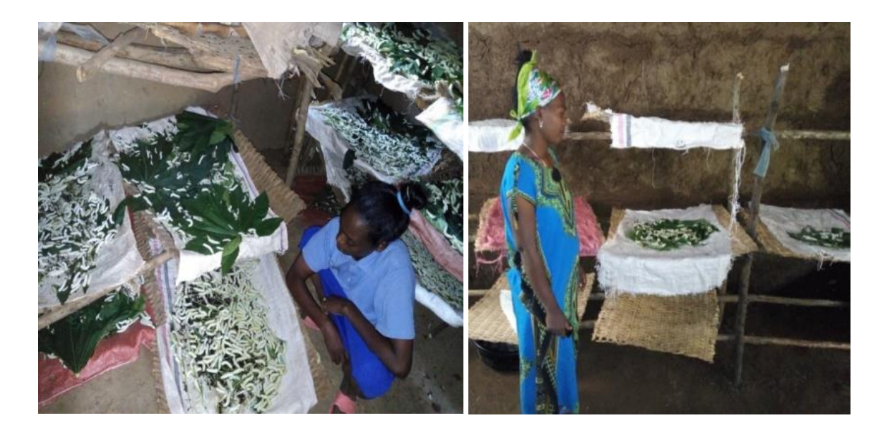
Figure 3. Silkworm rearing at smallholder women Figure 4. Silkworm rearing at youth enterprise

As indicated in Figure (3) and (4), silkworm rearing at both youth enterprise level and smallholder women is not well ventilated and kept sanitized. But, studies conducted in sericulture production identified that silkworm management practices are of vital important success factors for sericulture industry. Among the management practices, silkworm bed spacing plays a major role on growth and productivity of silkworm. Good quality cocoons are produced through applying appropriate silkworm bed spacing and significant deviations from these levels make the cocoon quality poorer (Tilahun et.al., 2017; Pandit et.al., 2008). Rearing room for young silkworm larvae, rearing room for grown silkworm larvae, room for mounting of silkworm larvae, and tools for silkworm rearing must be sanitized and cleaned before, during and after rearing, hands must be washed and shoes changed when entering the rearing room to prevent the introduction of disease-causing bacteria (Pandit et al., 2008). The rearing room surroundings cannot be said to be a sanitary, and rearing rooms that have a dirt floor, clay walls, and a wooden cocooning frame are difficult to disinfect. Furthermore, the rearing bed in direct contact with the silkworms is covered with a plastic sheet, which is used repeatedly, and disinfection and cleaning cannot be completely carried out (Sharma et al., 2015). These shows that sericulture production in study area needs pay attention to upgrade producers' management level.